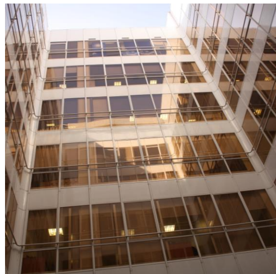
Inside View of the Building