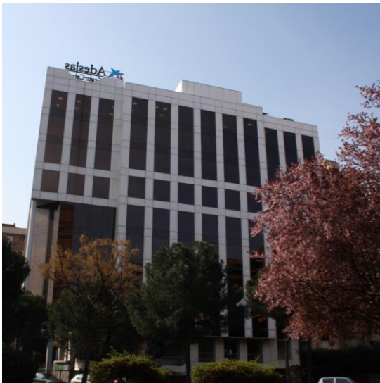
Facade of the Building

This new acquisition of the SOCIMI managed by Grupo Lar comes after the purchase of the shopping centers "Txingudi" in Irún and "Las Huertas" in Palencia last March and the commercial building occupied by Media Markt in Villaverde, Madrid. With this transaction, the total amount invested by Lar España amounts to EUR 72.7 million, 18% of the capital raised in the IPO. It constitutes an off-market transaction that has been fully paid for using company funds.