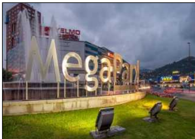
Centro comercial Megapark Barakaldo