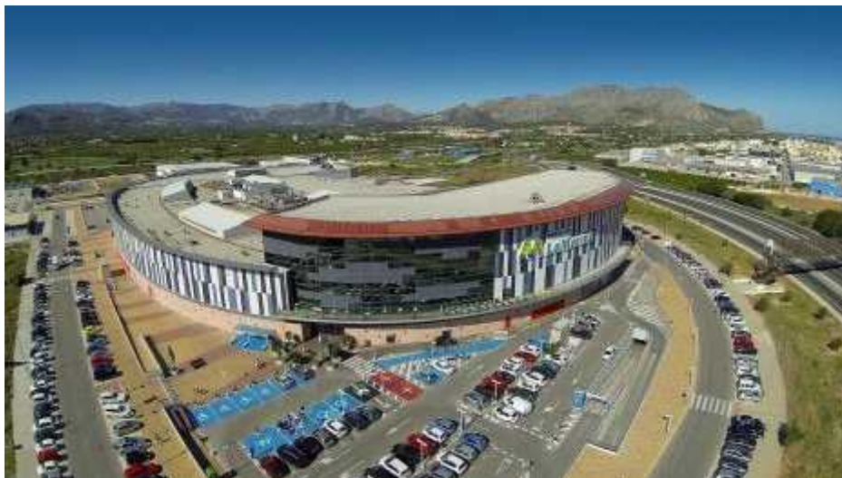
Centro comercial Portal La Marina

Por tipo de activos, los centros comerciales han alcanzado una revaloración del 7,5%, frente al 4,4% de finales de 2015; el valor de las oficinas ha aumentado el 13,7% - 6,6% a diciembre del pasado año -; el de los centros de logística se incrementó el 14,1% - 11,1% en el cálculo anterior - y el activo residencial con que cuenta la SOCIMI se revalorizó el 7,3%, en línea con el porcentaje de finales de 2015 y que fue del 7,1%. La valoración de los activos ha sido elaborada por Cushman & Wakefield y Jones Lang Lasalle.