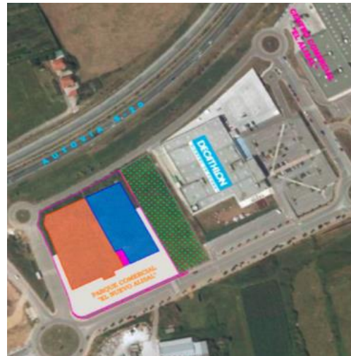
Aerial views of the location of the retail park Nuevo Alisal