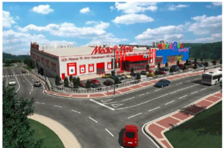
Facade of the commercial units Nuevo Alisal acquired by LRE

The commercial area, built in December 2010 and, until now, owned by local developer Grupo Sadisa, is located 3 kilometers to the west of Santander and has a gross leasable area (GLA) of about 7,648 sqm, divided into 2 floors and including 340 parking spaces.