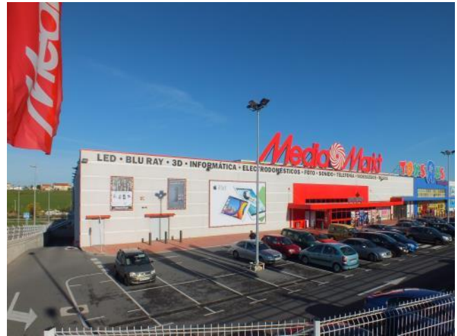
Main entrance and parking area