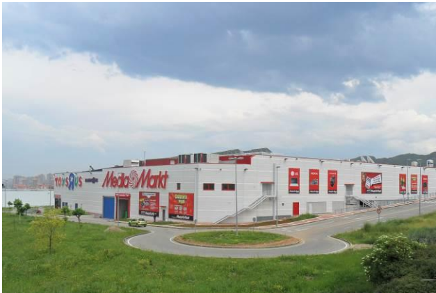
Perspective of the asset acquired by LRE