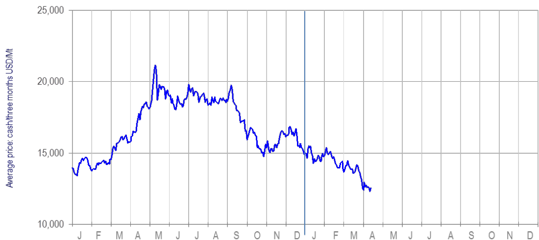
Official nickel price on the LME 2014 and 2015

The order book is increasing, but prices are still low due to the aforementioned circumstances and pressure from imports.