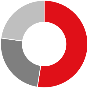
H1 2013 Gross sales under banner