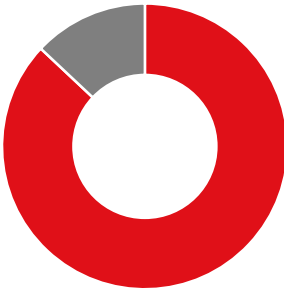
H1 2014 Adjusted EBITDA